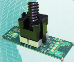
180 angle head