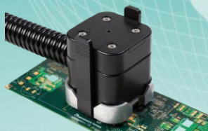
Right angle head

MaxTC Power Plus G4 is the most high-performance System. Handling high power dissipation DUT's, by direct conduction testing, available today